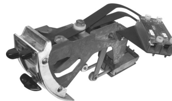
OEM '55-'56 Chevy control with supplied Electronic Cable Converters™ installed from Gen IV kit.

Our exclusive Electronic Cable Converters™ easily replace the stock cables to convert your stock control panel to the Gen-IV technology.