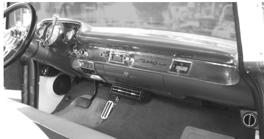
1957 Chevy installation with center plenum.

Note: Our re-engineered Tri-five Chevy Sure Fit kits now include Tite Fit compressor hard lines. Lines are now rerouted through core support and drier mounts behind. These kits may be upgraded to include our polished Tite Fit line kit and our popular polished Proline compressor/alternator bracket (see page 68).