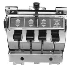
OEM '57 Chevy control with supplied Electronic Cable Converters™ installed from Gen IV kit.