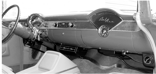
1955-56 Chevy installation with center plenum.