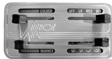
48103-SHQ 4 Lever Machined Horizontal Panel 4.69" wide x 2.5" tall. Internally lighted.