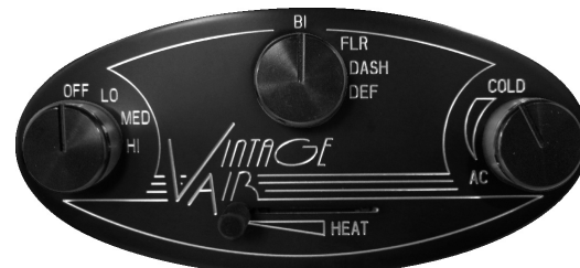
481005 Streamline™ black anodized Gen-II Pro Panel 5.5" wide x 2.5" tall. Back lighted knobs.