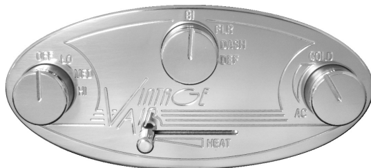
48104-RHQ Streamline™ Gen-II Pro Panel 5.5" wide x 2.5" tall. Back lighted knobs.

This Gen-II control panel features same styling and dimensions as original Vintage Air design! Engraved and polished panel face. Internally lighted polished aluminum knobs.