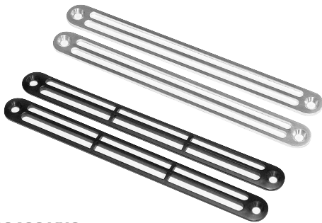
63100-VUQ Machined aluminum defrost duct trim. (Pair) 6.5" x 0.625"