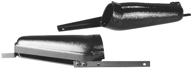
63380-VCE Compact universal defrost ducts. (Pair) 6.5" x 2.5"