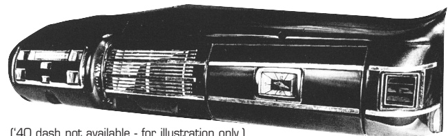
('40 dash not available - for illustration only.)