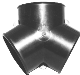
49592-VUI 2.5" Y connector.