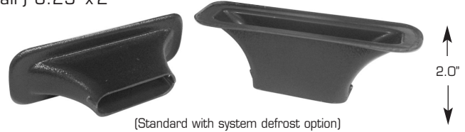
(Standard with system defrost option)