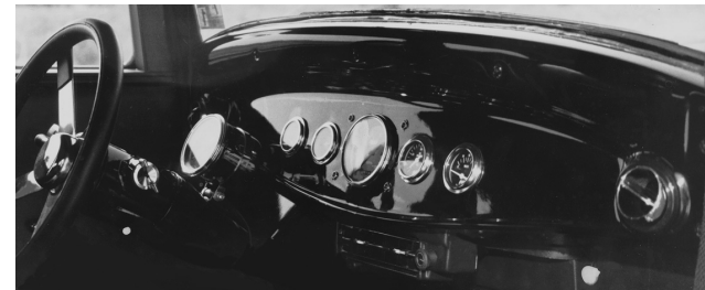
49160-VFI Dash w/out built-in louvers.