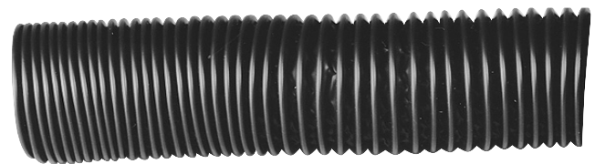
06200-VUE 2" Duct hose.