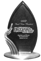
Hot Rod & Resto Award Winning Technology!

Complete kit includes: Evaporator, condenser, drier, compressor, compressor bracket, hose kit and hi/lo safety switch.