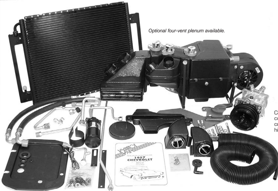
Optional four-vent plenum available.

Vintage Air SureFit Chevrolet a/c, heating and defrost systems are designed specifically for your classic Chevy. The Gen-IV SureFit systems require no fabrication and are designed to install using existing holes in your dash and firewall in most cases.