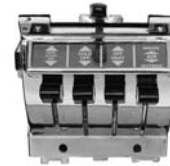
OEM '57 Chevy control with supplied Electronic Cable Converters™ installed from Gen IV kit.