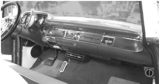
1957 Chevy installation with center plenum.

Note: Our re-engineered Tri-five Chevy Sure Fit kits now include Tite Fit compressor hard lines. Lines are now rerouted through core support and drier mounts behind. These kits may be upgraded to include our polished Tite Fit line kit and our popular polished Proline compressor/alternator bracket (see page 68).