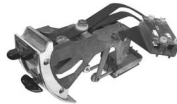
OEM '55-'56 Chevy control with supplied Electronic Cable Converters™ installed from Gen IV kit.

Our exclusive Electronic Cable Converters™ easily replace the stock cables to convert your stock control panel to the Gen-IV technology.