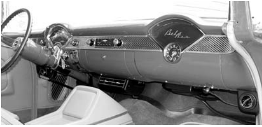
1955-56 Chevy installation with center plenum.