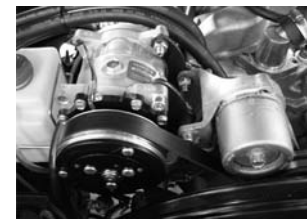
141805 Sanden / R4 multi-groove conversion bracket