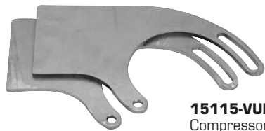
15115-VUB Universal Compressor Bracket

15815-VUB Adapts York bracket to Sanden compressor