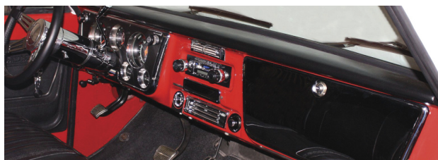
1967-72 Chevy truck dash with SureFit kit.